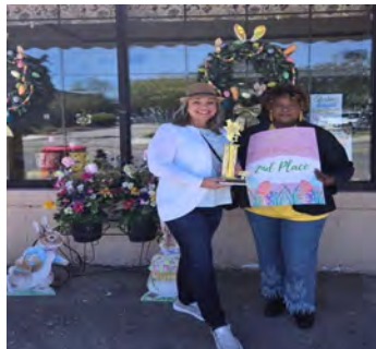
Beehive Hair Salon