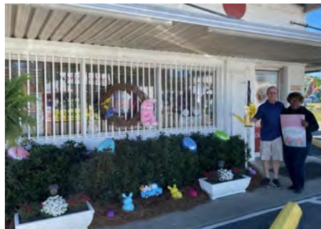
Mozingo Liquor, Inc.