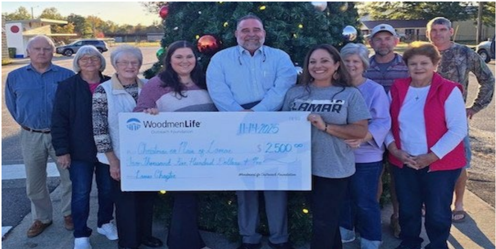
Woodmen Life Lamar Chapter presents Christmas on Main a $2,500 grant.

THIS TOWN IS WITH YOU, SILVER FOXES! GO GET IT!